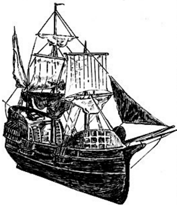
MODEL OF THE MAYFLOWER

In the Office of The Society of Mayflower Descendants in New York