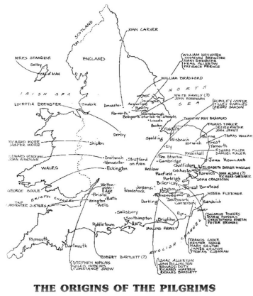
Pilgrims Origins map