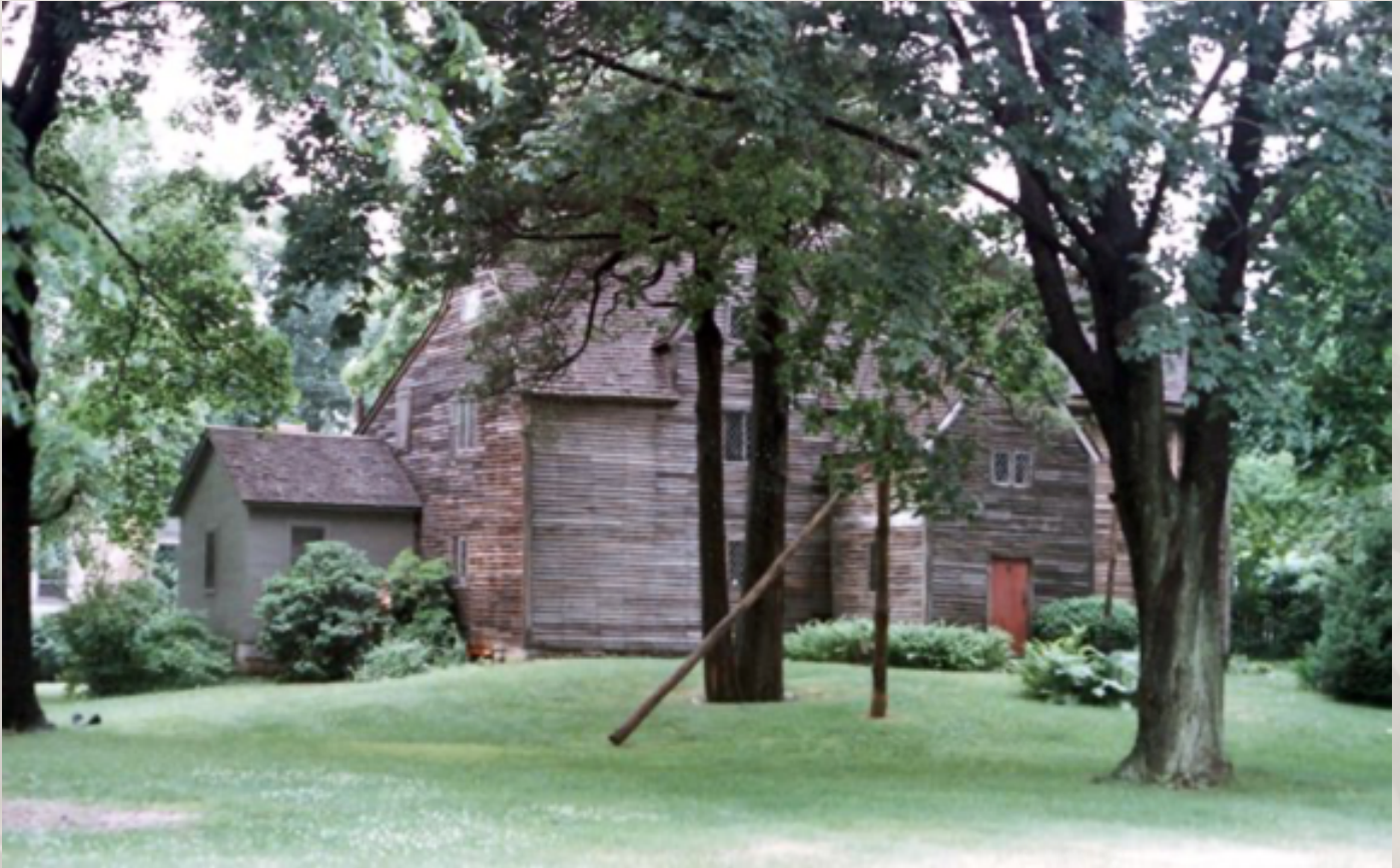
Hempstead House New London, CT

April 2025