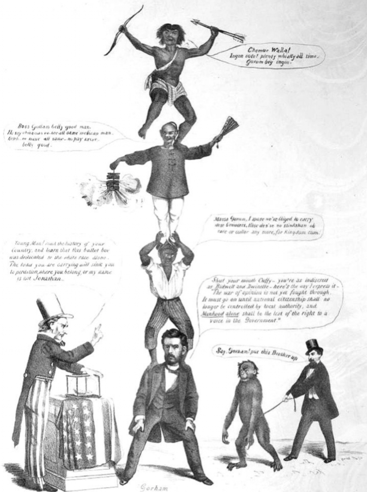
THE RECONSTRUCTION POLICY OF CONGRESS, As illustrated in California.