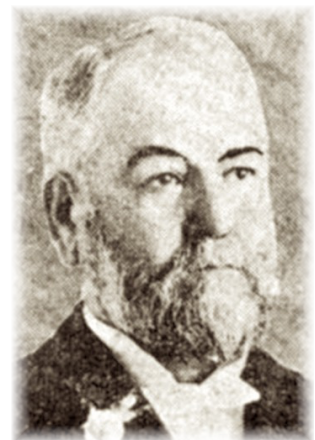
Hon. Charles Miner

Burial: 7 Mar 1912, Marysville City Cemetery, Marysville, California 3931